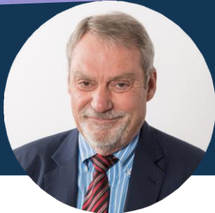
GEOFF NUNN & ASSOCIATES Independent Board and Remuneration Advisors